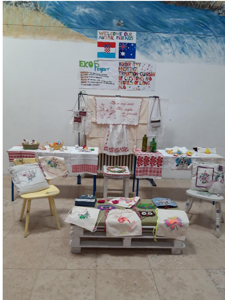
IZLOŽBA RADOVA 5P PROJEKTA POVODOM DOLASKA AUSTRALSKOG ZBORA U NAŠU ŠKOLU, 10. 04. 19.